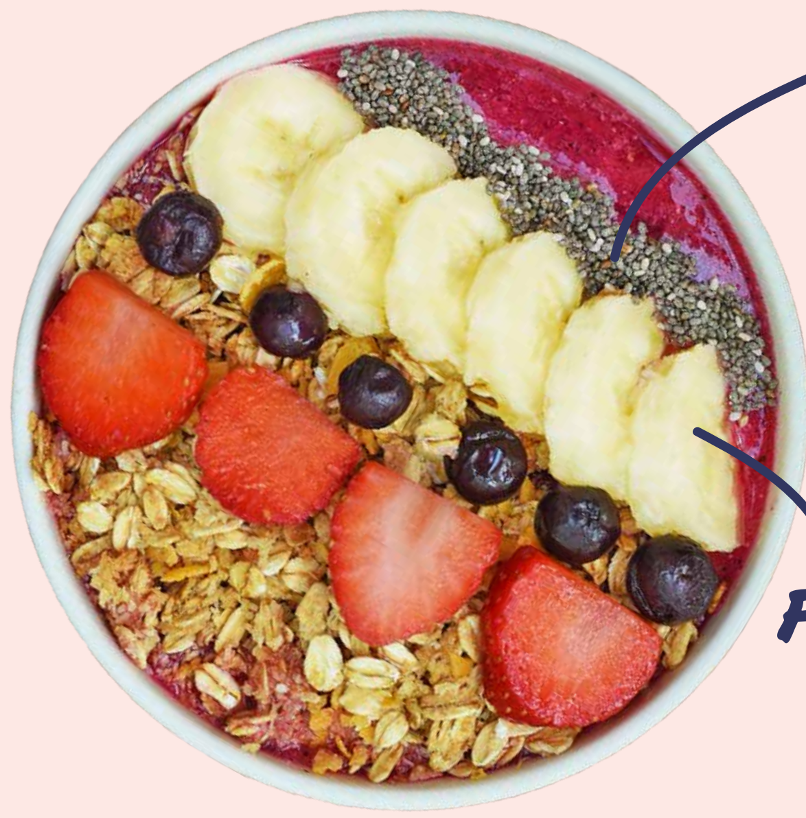
Chia seeds Fresh fruits!